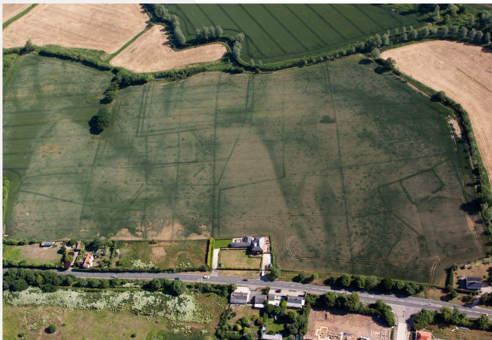
Specialist aerial photograph of an Iron Age - Roman settlement site (EX15/01/104)