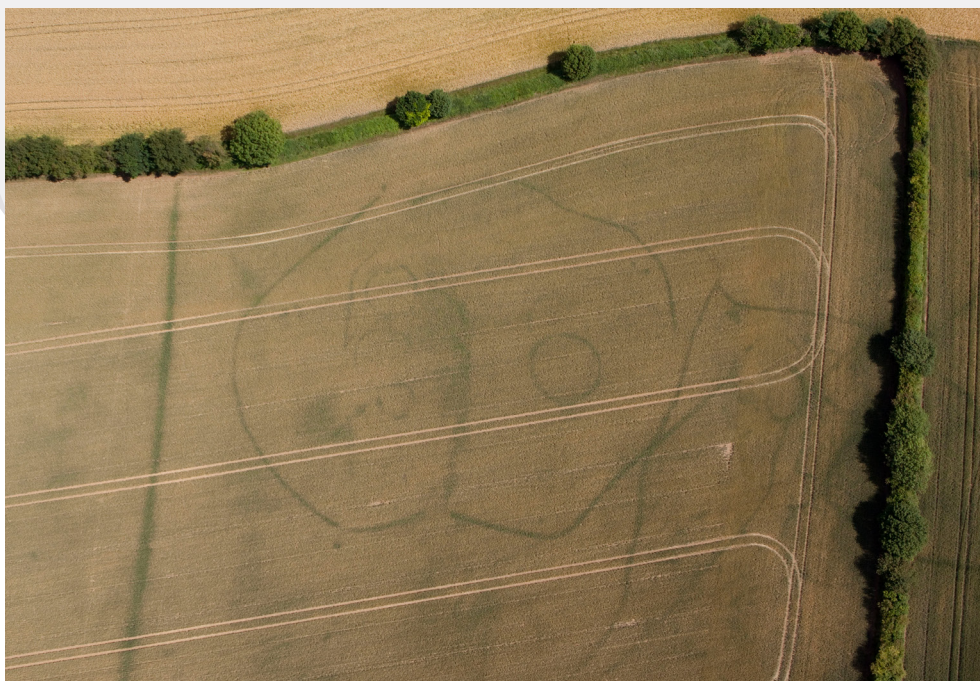
Specialist aerial photograph of a prehistoric settlement site (EX11/02/194)